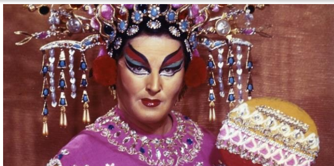
Birgit Nilsson in Turandot

Sign up by June 24: at bulletin board at your hotel or at: www.svenskseniorgolf.se/baringstad-big-5-excursions.html