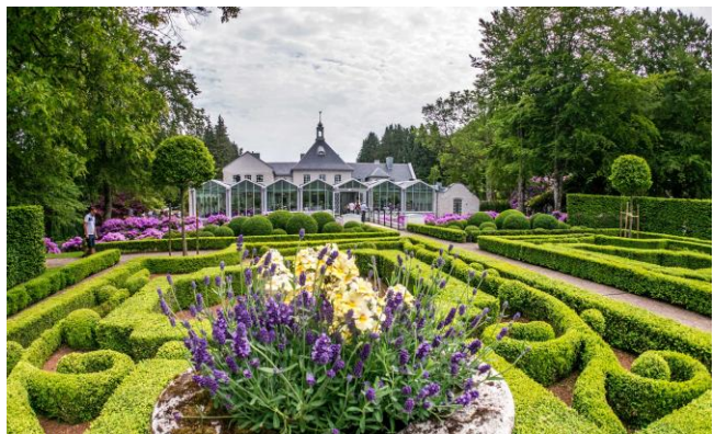
A part of the beautiful gardens of Norrviken

Wednesday June 26, 10.00 or 15.00, 1,5 hour guided tour. Pick up point at Norrviken's ticket office. Price 250 SEK (25 €) per person. Shuttle buses will be available, and start from your hotel around 30 minutes in advance.