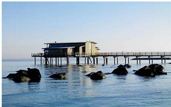
Båstad by the sea has a lot to offer every visitor

In Båstad you can walk along the beach, go shopping for great memories, enjoy the overall scenery and the many beautiful houses. In addition to all this we offer 5 gems that are highly appreciated of most people who visit Båstad. Here is a short description, ask in your hotels for more information and welcome to join us to see them, or make your own visit. Three of them need you to sign up by June 24 th , see below.